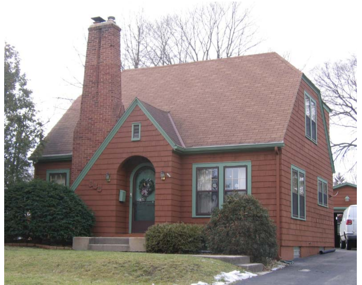
A perfect unaltered Kenwood In Aurora, Illinois.