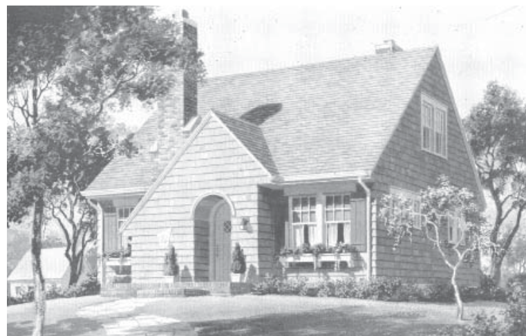
The Gordon-VanTine Burton from their 1932 catalog.